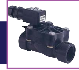
Optional Solenoid Shut-Off Valve