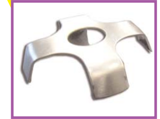
Quartz Sleeve Stabilizer